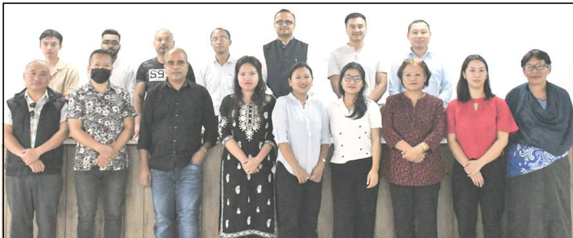
May 16 nü DC Conference Hall, Kohima nung Kohima District TB Forum-DAPCC senden amenba mapang tangokba noksa nung angur.

Dimapur, Monupii/May 16 (TYI): Kohima District TB Forum-DAPCC senden May 16 nü Deputy Commissioner Kumar Ramnikant, IAS lenisüba nung DC indang Conference Hall nung menogo. Senden nung TB tashidak kokteter alir kati National Tuberculosis Elimination Programme (NTEP) kübok tashidak anepaluba indang tajangshiba lemsatepa liasü. Paisa, mozü, treatment angati agütsüba aser temang anepaluba mapang senotsü teyari agütsüba atema kanga pelaba lemsatep. Pai, kecha tetsükdaktsü madokdaktsü ita trok mozü shidak chia treatment tembangtsü koda tongibang iba indang lemsatepba den külem TB agi shirangertem dang iba facility ya takok tashi agütsü