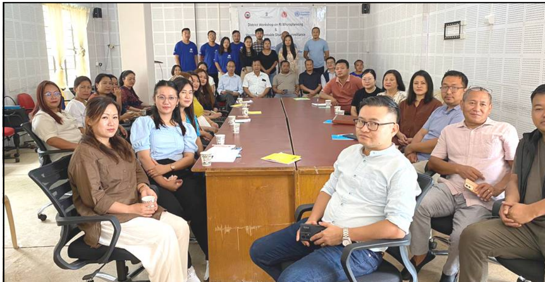
May 16 nü RI Micro Planning and Vaccine Preventable Diseases Surveillance dak sendakba nung workshop ka agiba mapang CMO Mokokchung, DPO (UIP & RCH) aser shisalen sayurtem den training nung shilem agirtem tangokba noksa nung angur.

Dimapur, Monupii/May 16 (TYO): Mokokchung District atema RI Micro Planning and Vaccine Preventable Diseases Surveillance workshop May 16 nü Chief Medical Officer, Mkokchung Conference Hall office nung agiogo. Vaccine agütsü atsiuyongba, Partially Vaccinated (Dropout) aser Zero dose children (Left