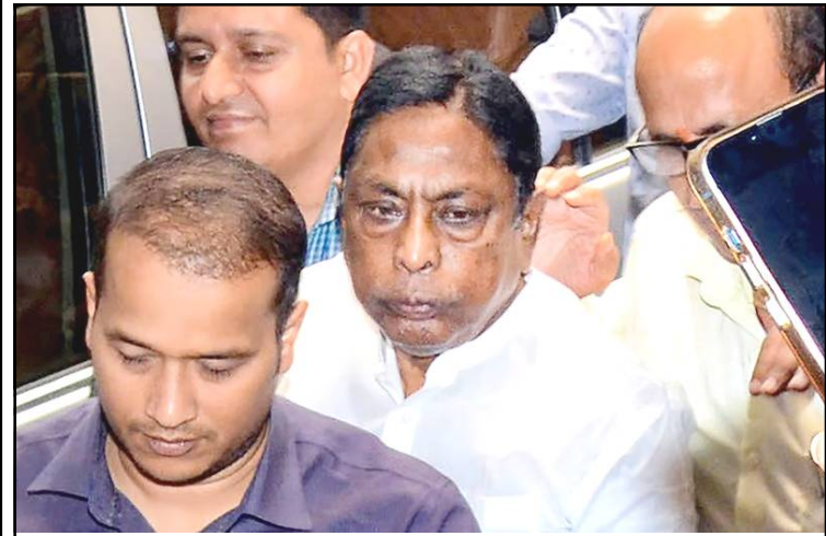
May 16, 2024 nü Ranchi nung Jharkhand Minister, Alamgir Alam court kati anir aodang tangokba noksa nung angur. Alamgir Alam indang secretary Sanjeev Lal'er kidang sen aika apuba ken o dak sendakba nung Bodhbarnü ED-i Alamgir apu.

Kanga bulua timtemba AESI rongnung tainlonglong rogo aika teküp aser teküp telung nung timtem, tongtoret aser tezü nung timtem adok. Taintem rongnung shi-tetsü den tongtoret aser tezü nung timtem ajangshi.