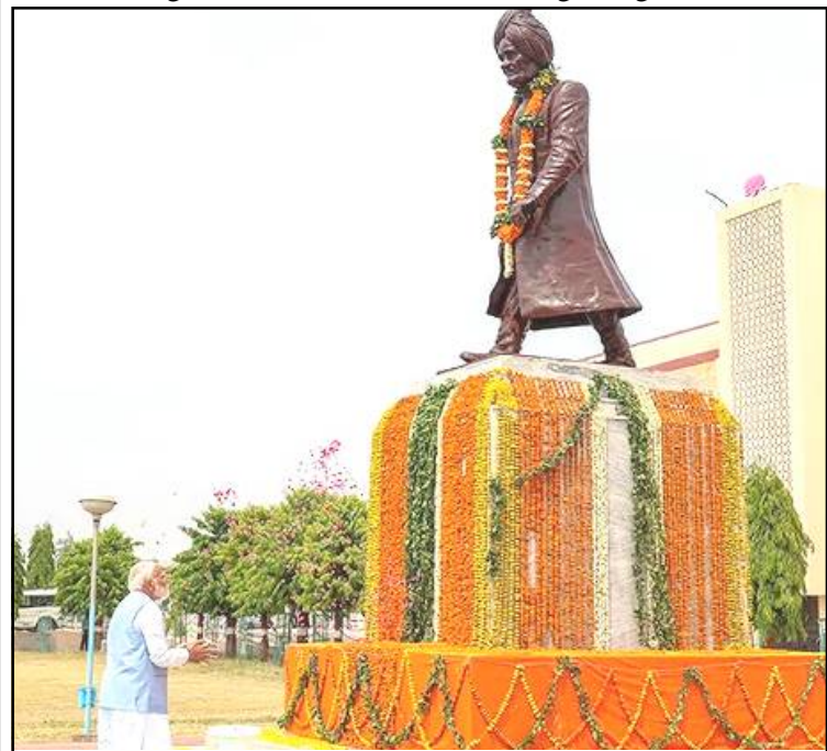
May 17, 2024 nü Uttar Pradesh nung Haripur district kübok Rath jila nung Ato kilonser, Narendra Modi-i Swami Brahmanand nem akhüm agütsüdang tangokba noksa nung angur.

2050 küm tashi nungbo India nung nisung million 148.3 (crore 14.83) bo climate change ajanga kanga mejungi kongshiba tesemtem nung alitsü, ta asadantgetdango.