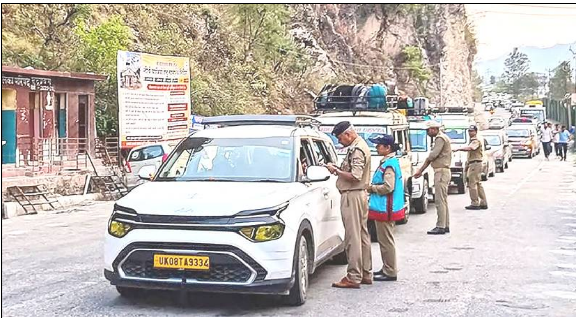
May 17, 2024 nü Rudrapur district nung police-i Kedarnath tekülem kidangi temeshi aini aoertem indang 'Char Dham Yatra' registration mita reprangdang tangokba noksa nung angur.