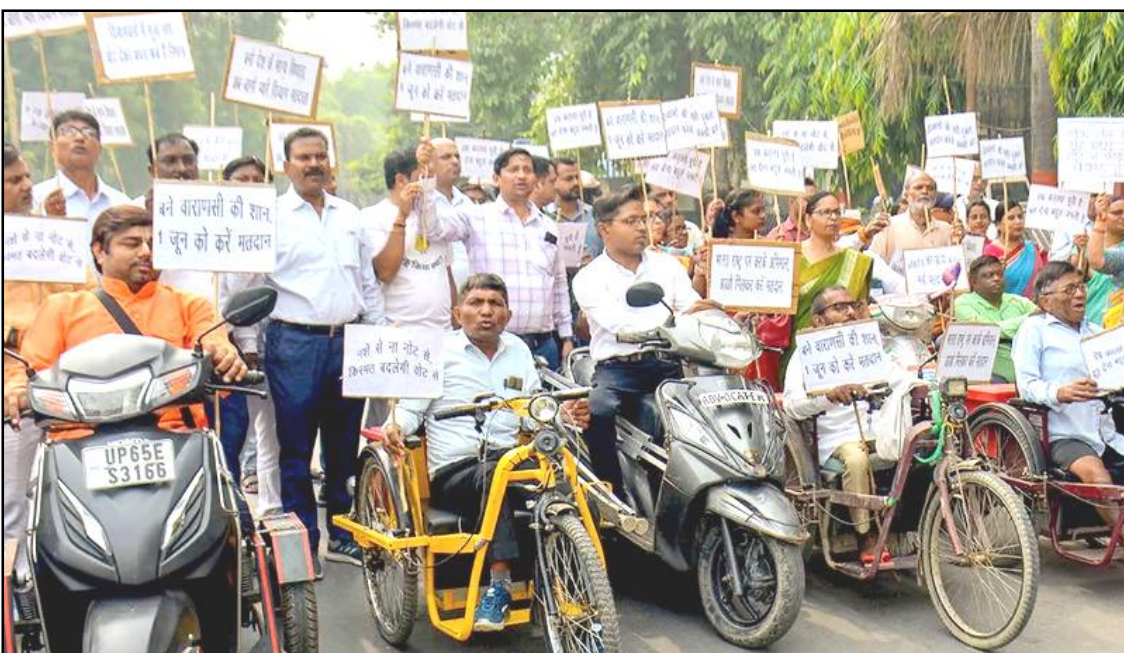
May 17, 2024 nü Varanasi nung matamabensartemi Lok Sabha election nung vote agütsütsü atema nüburtem ajungshia shilem agidang tangokba noksa nung angur.

Russia nung visa-free tourism program ya India den dang masü. Yaküm August ita nunga Russia-i China aser Iran na den iba tezüngzüktep agitsü atema maparen tenzüka liasü.