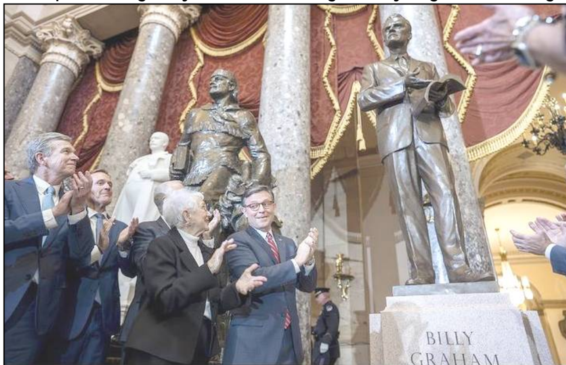
May 16, 2024 nü US Capitol, Washington nung sayutsüngir Rev. Billy Graham kürakyanglu semzükdang (abelen nungi) North Carolina Governor Roy Cooper, Senator Ted Budd, R-N.C., Republican Virginia Foxx, R-N.C aser House Speaker Mike Johnson nungeri teka amaba noksa nung angur.

Washington, May 17 (Agencies): Brihostibarnü US Capitol, Washington nung sayutsüngir, asür Rev. Billy Graham indang kürakyanglu semzükogo.