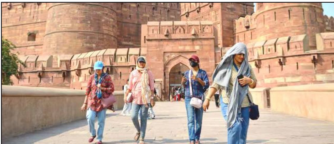
Indian Meteorological Department (IMD)-i taruba anogo asem tashi India tesem balala nung kanga tatsük asütsü, ta tekümdangtsü metetdaksüogo. Talisa Delhi, Punjab, Haryana, Rajasthan aser Uttar Pradesh state tem nung kanga tatsük asütsü, ta IMD-i metetdaksü. Taaruba anogo pongu tashi northwest India tesem aika nung kanga tatsük asütsü aser taruba anogo asemnü tashi east & central regions nung kanga tatsük asütsü, ta parnoki metetdaksü.

April 17 nüa Anantnag kübok Bijbehara jila nung tanga state nungi arua aayanger ka khaseta liasü. April ita nungsa Shopian nung kiralongrartemi Dehradun nungi arur ka injang agi yiruja liasü. February ita nunga Srinagar nung kiralongrartemi Amritsar nungi arur ana injang agi yirutsü aser tena rongnung kabo süadok.