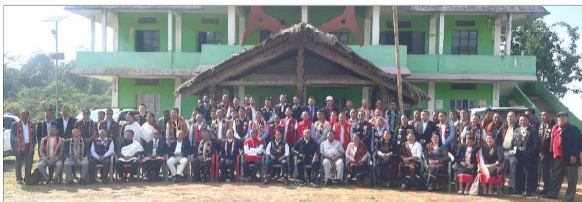
May 18, 2024 nü Chozuba yimtsüing nung Sumi aser Chakhesang nunger tsüingda Joint Declaration agidak adenertem agiba noksa angur.

Dimapur, May 19, 2024 (Agencies): Sumi aser Chakhesang nunger lennirtem May 18, 2024 nü Chozuba yimtsüing nung adenshir Joint Declaration ka nung sign sütepogo.