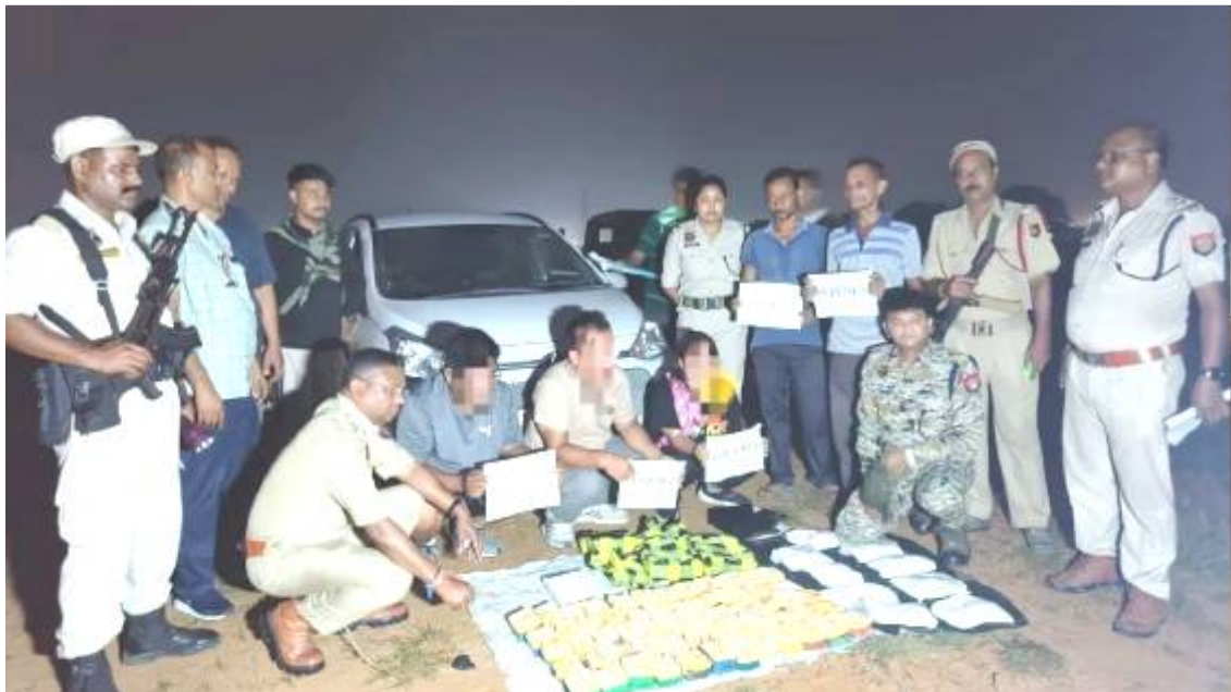
Assam kübok Cachar district nung police-i Rs 105 crore jenjang heroin apuba sülen agiba noksa ka angur. Mozü shibelener nisung asem ya Mizoram nunger lir aser Mizoram nungi heroin bener aru. Par aseme gari ka nung secret chamber telung nung miima bena liasü saka police-i sapon pongdangtem nung enoka aliba heroin seret 10.33 bena alibaji apu.

Iba tatalokba atema Lamphel police station nung ken o ka benokogo aser police-i bushisüngdang tenzükogo.