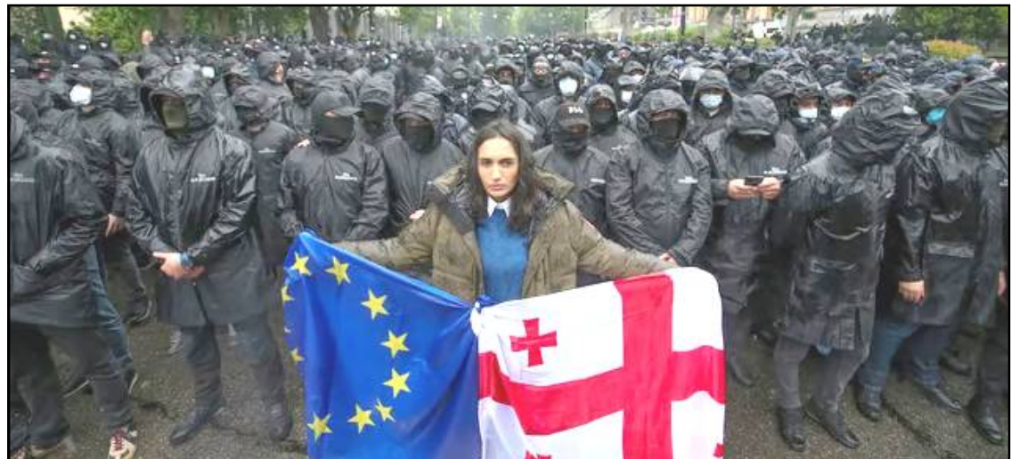
Georgia tir Salome Zourabichvili-i la tashi amshia foreign influence bill veto süogo. Iba bill ya "fundamentally Russia" ta jatsüa Georgia tir-i tatemangbuba temelaba agütsütsü memulung aser parliament dang European Union nung adentsü atema linük tejangraba aliba den putepa inyaksangshitsü mepeshi. Lai social media sabang X ajanga Georgian Dream Party-i agizükba bill ya lai veto asüba sangdonga liasü.

Kamerhe ya parliament nung speaker mapa atema candidate ka lir. Iba mapa atema election Honibarnü agitsü liasü saka Tshisekedi-i thinentüsü.