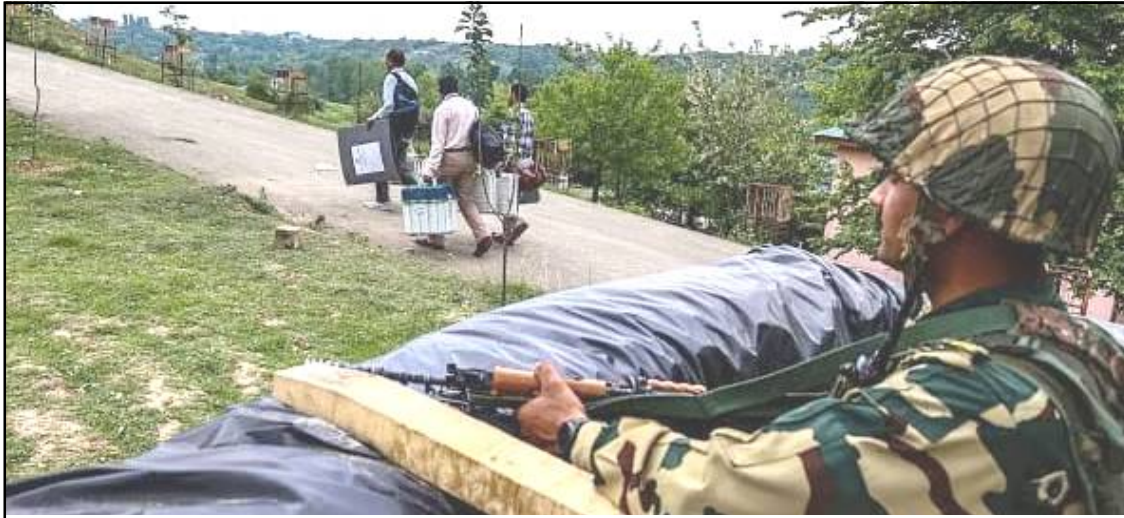
Baramulla, May 19, 2024: Hombarnü Lok Sabha election shilem pongububa agitsü lia Amongnü Jammu & Kashmir kübok Baramulla nung Polling ketdangsertemi Electronic Voting Machines (EVM) aser Voter Verifiable Paper Audit Trail (VVPAT) machines bener pepei polling stations-i apusoa aodang tangokba noksa nung angur.

New Delhi, Monupii/May 19 (Agencies): Hombarnü states aser Union Territories 8 nung Lok Sabha election shilem pongububa nung menden 49 atema election agitsü.