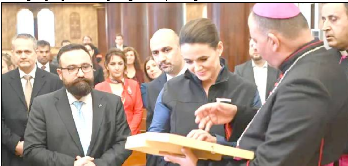
December 2022 nung Hungarian President Katalin Novák (tiyongtsüi) Iraq semdangdang agiba noksa angur. Islamic State-i Khristantem teimba ser aliba jila ka atsünga agiba aser raksatsüba sülen Hungary teyari ajanga iba jila yanglushitsüba atema lai Iraq semdanga liasü.