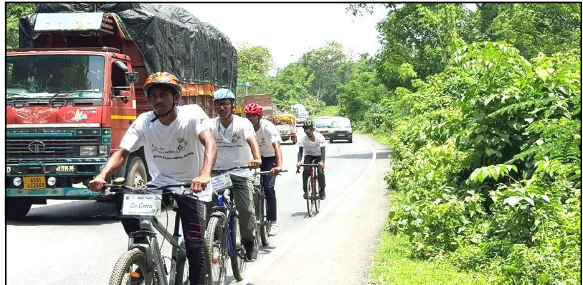
Assam nung libajen wazüka ayutsü asoshi osang sangdonga cyclist nisung ti-i May 19 nü Kaziranga National Park nungi Orang National Park tashi kilometre 160 talang lenmang nung cycle bener jaja liasü. Iba mapang parnoki tesem balala nung anena nüburtem dang libajen wazüka ayutsü asoshi osang sangdong aser iba sentong May 21, 2024 nü tembang.

Assam sorkari dancers aser drummers shia nem Rs 25,000 agütsü.