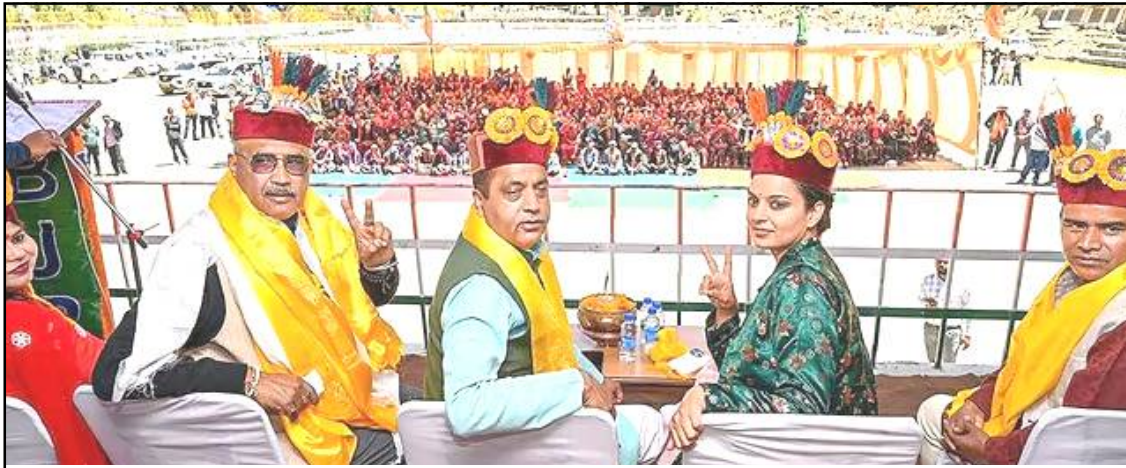
May 22, 2024 nü Udaipur nung BJP lenir aser taoba mapang Himachal Pradesh chief minister, Jairam Thakur den Mandi constituency nungi BJP candidate, Kangna Ranut aser tangartem election nüboyim sentong ka nung tangokba noksa nung angur.