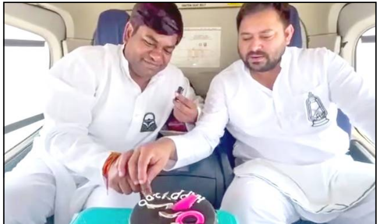
May 23, 2024 nü Patna nung RJD lenir, Tejashwi Yadav-i (ajichilen) election nüboyim sentong 200buba nung shilem agiba nungtem nung helicopter ka nung cake rangsadang tangokba noksa nung angur. Kasa noksa nung Vikasheel Insaan Party (VIP) Tir, Mukesh Sahani-a angur.