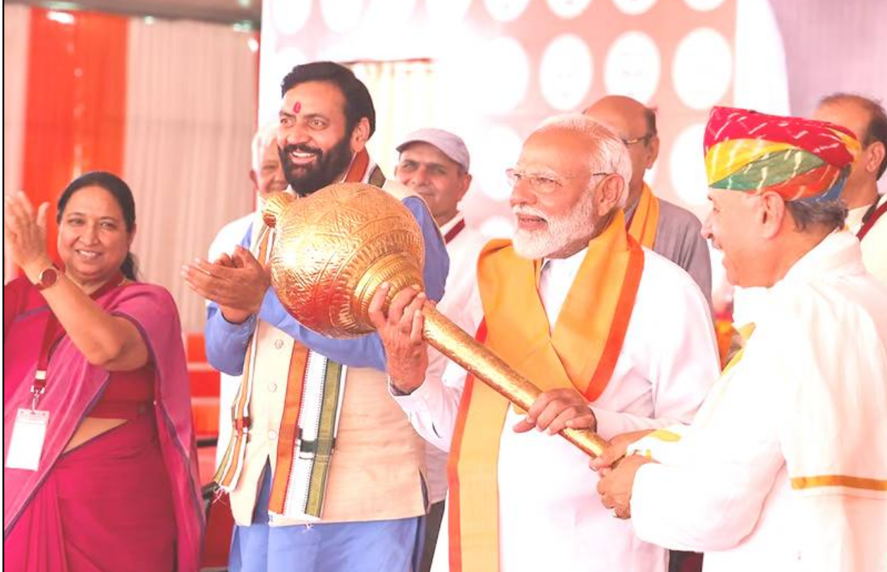
May 23, 2024 nü Mahendragarh district nung Lok Sabha election sentong ka nung Ato kilonser Narendra Modi aser Haryana Chief Minister Nayab Singh Saini na tangokba noksa nung angur.