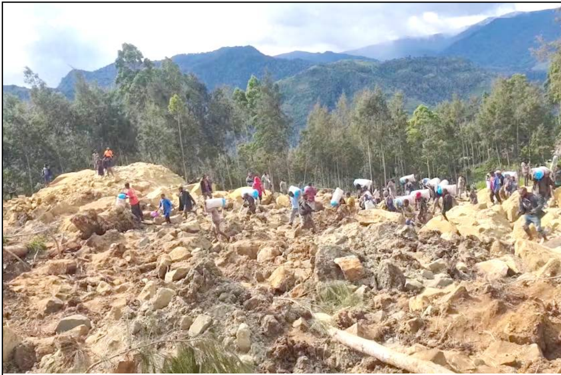
Enga Province, Papua New Guinea nung anentsüh aluba sülen May 24, 2024 nü nūburtem osettsüset bener aodang tangokba noksa ka yangi angur.

Port Moresby, Monupii/May 24 (Agencies): Papua New Guinea nung aliba tenemlen anentsüh tulu alu aser yangji nisung aika sür alitsü ta yangji aliba ketdangsur aser teyari agütsüba telok temin ashir.