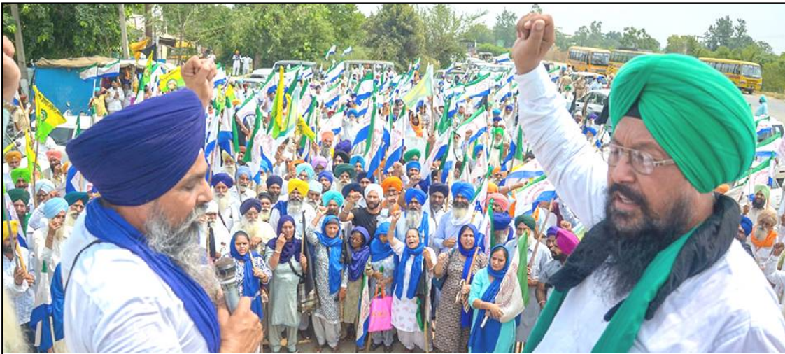
May 24, 2024 nü Gurdaspur nung Ato kilonser, Narendra Modi-i Lok Sabha election sentong ka nung jembitsü lia aluyimertem longkak aita iba tesem jagi aodang police-i nokdangba sülen tangokba noksa nung angur.