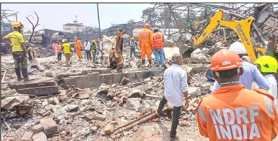
May 23, 2024 nü Thane nung chemical factory ka nung boiler ka apokba tesem nung Hokolbarnü NDRF sepaitem mapa inyakba noksa nung angur. Iba lendong nung nisung 9 asü aser 64 yirua liasü.

MP Anar'er medemer aser US senso kati Anar tepsettsü atema teburtem nemji sen crore 5 shi agütsü, ta bushitetogo. Anar'er medemer tetsür laji Kolkata kübok New town area nung ki ka lir saka tang labo United States nung lir.