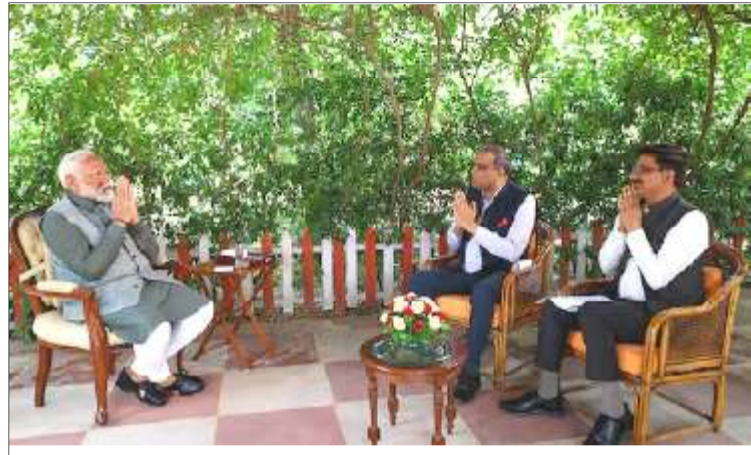
Prime Minister Narendra Modi-i NDTV osangbener den sensaksemdang agiba noksa ka angur.

New Delhi, May 24, 2024 (Agencies): Prime Minister Narendra Modi-i Opposition ya pa tsükchir ama mebilemer saka Opposition lennirtem den külemi inyknür ta metetdaksüogo.