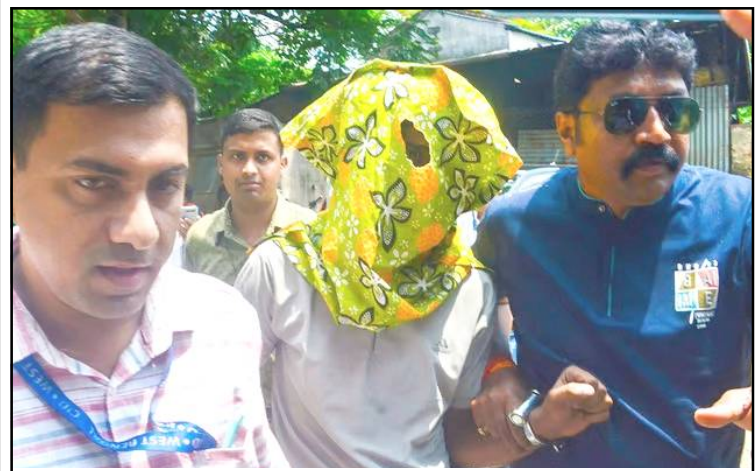
North 24 Parganas district, May 24, 2024: Bangladeshi MP, Anwarul Azim Anar tepsetba ken o dak sendakba nung Hokolbarnü West Bengal kübok North 24 Parganas district nung tai tonglokja apuba nisung ka court matsüngdangi anir aodang tangokba noksa nung angur.

"Ibaji miimbangtsü atema pai, Kejriwal ya kanga tesangra auer ta ashi. Tai nung apuba ya medentsütsü atema iba ya tiyazü kuli ka dang lir. Excise policy ya tai ta nai agizükra yimlibilema pua alir ajak chiokang," ta Aam Aadmi Party (AAP) tongti lenirisa ashi.