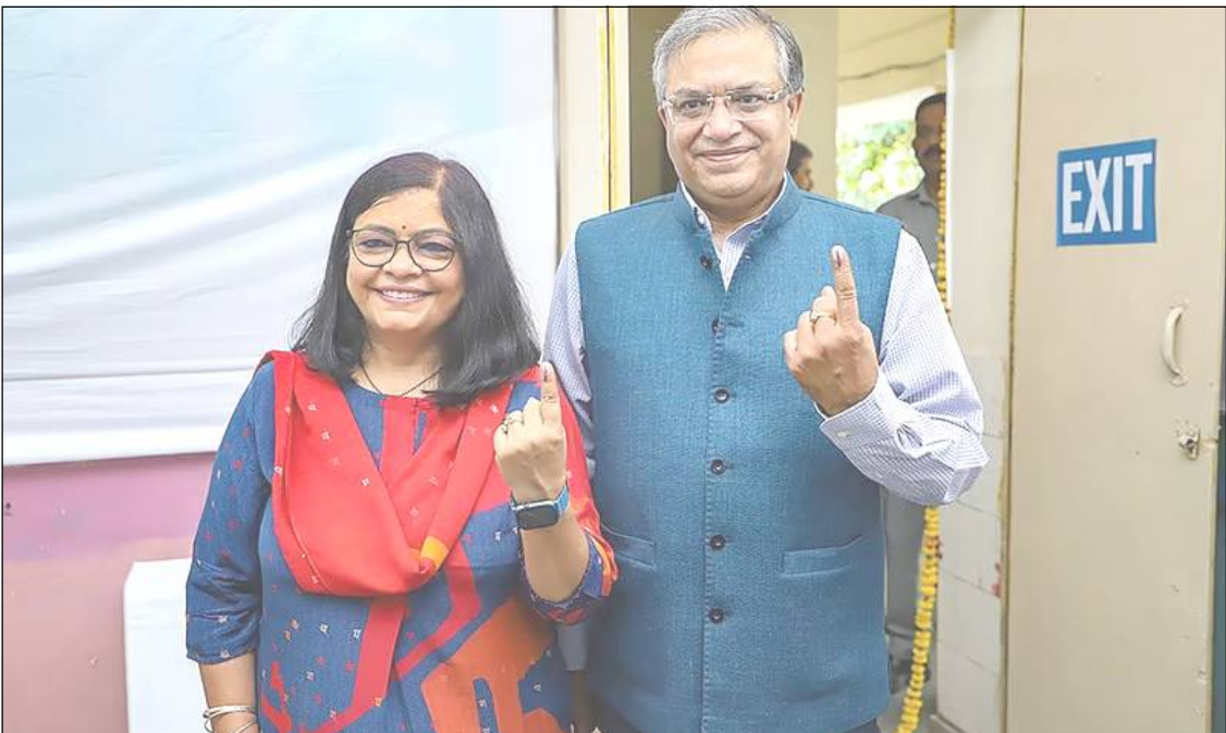
New Delhi, May 25, 2024: Lok Sabha election shilem trokbuba agiba anogo nung New Delhi nung Election Commissioner, Gyanesh Kumar-i polling booth ka nung vote agütsüba sülen tangokba noksa nung angur.

Iba yipru ajanga May 27-28 anogotem nung Assam aser Meghalaya tesem kar nung tzünglu kanga sashia arutsü, May 28 nü Arunachal Pradesh nung aser May 27 nü Tripura tesem kar nung tzünglu sashia arutsü.