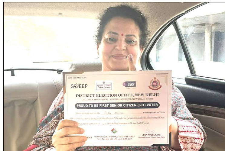
May 25, 2024 nü New Delhi nung National Commission for Women chairperson, Rekha Sharma-i polling booth ka nung vote agütsüba sülen meyipa aodang tangokba noksa nung angur.

Brihostibarnü Maharashtra state kübok Dombivli nunga mi lendong ataloka boiler ka apokba lendong nung nisung 11 asü.