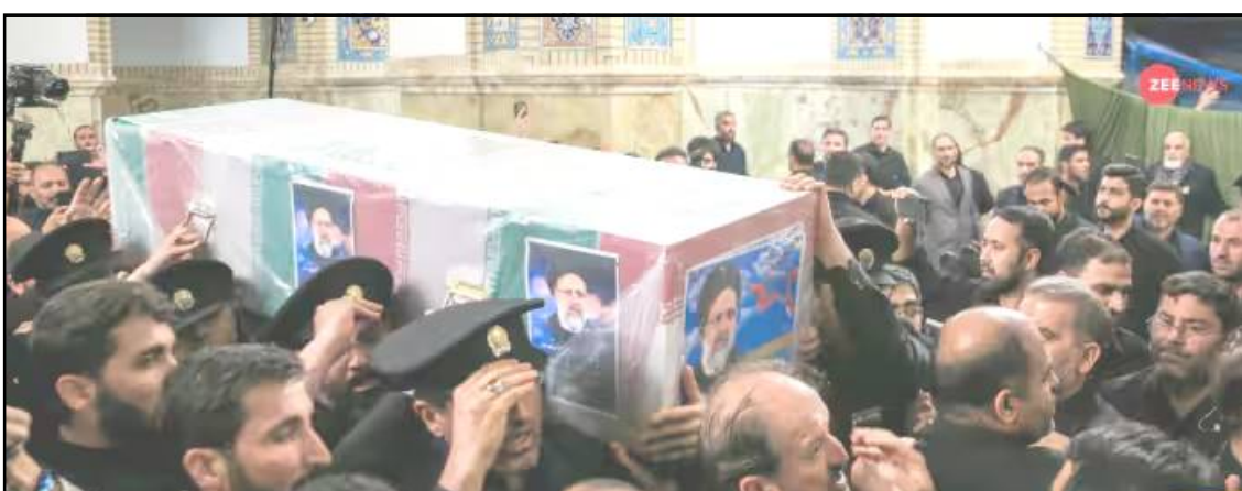
Helicopter tsükokba lendong ka nung asüba sülen tir Ebrahim Raisi Brestobarnü Iran nungertem atema temeshi yimti Mashhad nung remtsüogo, kong mangyimer meyirejang aika adenshia liasü. Azerbaijan anütoklen hydro project ka lapoktsüba sülen Tabriz yimti nung oil refinery ka lapoktsütsü atema oya aliba mapang Raisi mena aliba helicopter ya tenem ka nung tsükoka liasü.