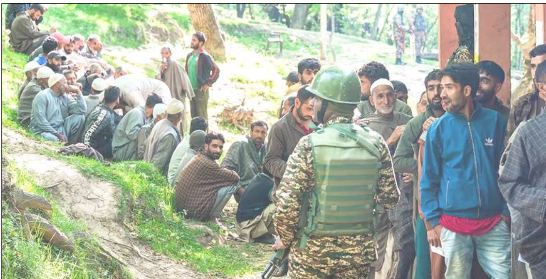
May 25, 2024 nü South Kashmir kübok Kulgan district nung aliba polling booth ka nung vote agütsüsü atema nisungtem tarensena nokdaka aliba noksa nung angur.