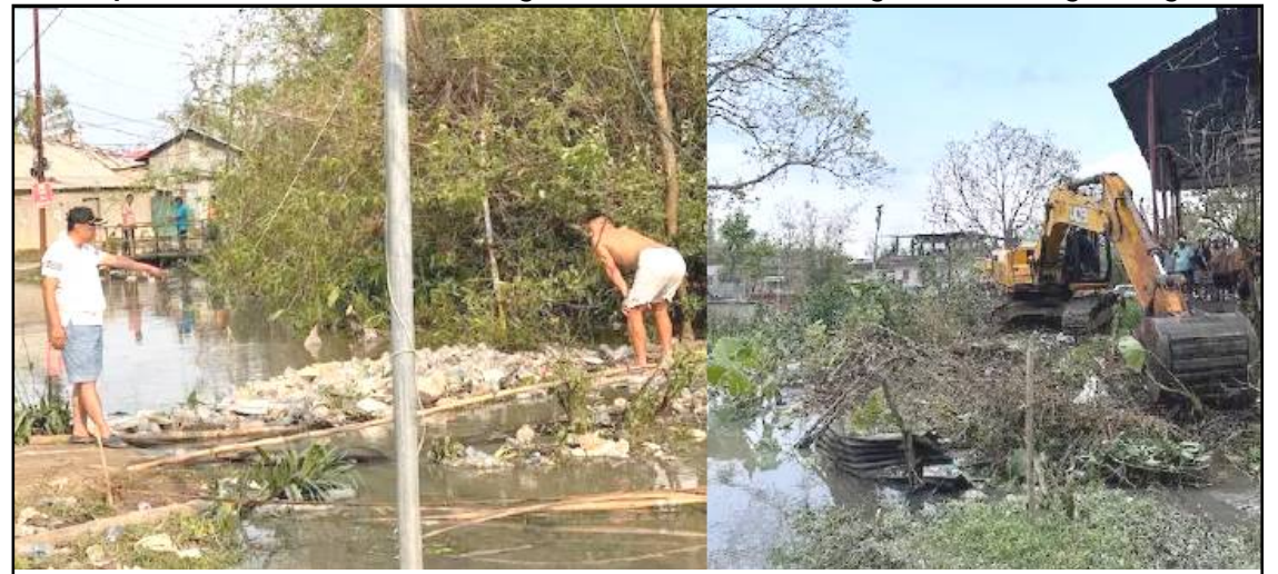
Imphal nung tzümetsüng tensa azüoktsü atema Hokolbarnü Mongshangei Maning Leikai area nungi Waisel Maril ta ajaba water channel merüktetba angur.

Imphal/Guwahati, May 31, 2024 (Agencies): Cyclone Remal ajanga Manipur nung tzünglu kanga arur aser Jiri River nung tzümetsüng ajanga ki 4 pongdok aser ki 250 metsüngbanga lir.