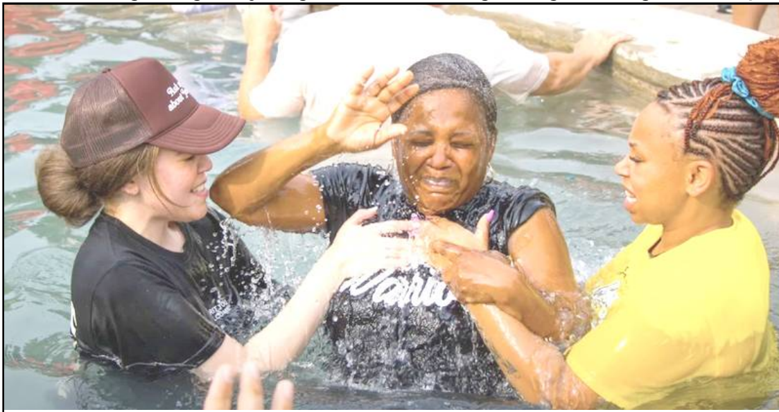
Taoba hopta Texas kübok Cedal Hill nung aliba Trinity Arogoi hopta piyong 'Summer of Baptisms' agia aruba sülen baptisüdang tangokba noksa nung angur.

May 31, 2024: Texas kübok Cedal Hill nung aliba Trinity Arogoi ayongzükba hopta piyong 'Summer of Baptisms' agia aruba sülen nisung noklang aika baptiogo.