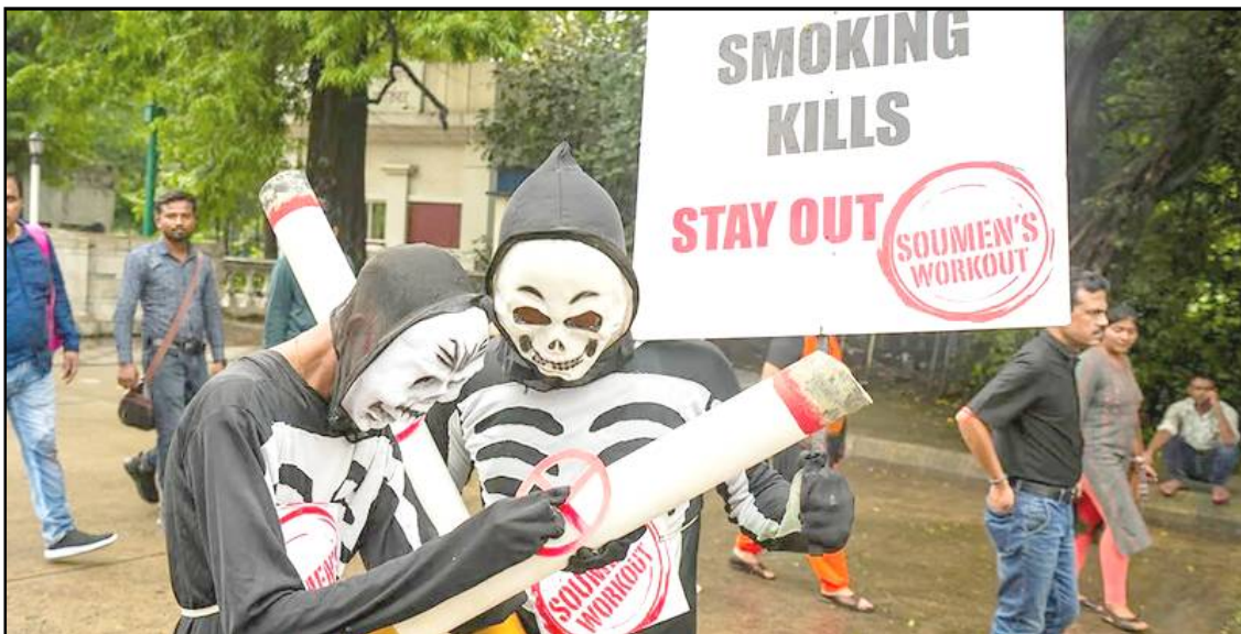
May 31, 2024 nü World No Tobacco Day anogomong nung Kolkata nung aliba Victoria Memorial kima moko machitsü awareness agüja shilem agirtem kar noksa nung angur.